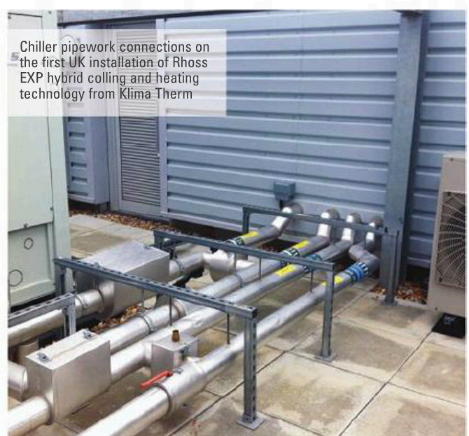
Chiller pipework connections on the first UK installation of Rhoss EXP hybrid cooling and heating technology from Klima-Therm