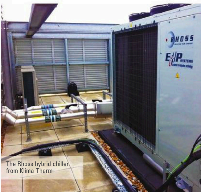
The Rhoss hybrid chiller from Klima-Therm

hensive technical documentation and proof of performance for the EXP system. EXP provides a good solution in situations where there is a simultaneous demand for cooling and hot water, and particularly in a building where there is significant potential for internal heat recovery."